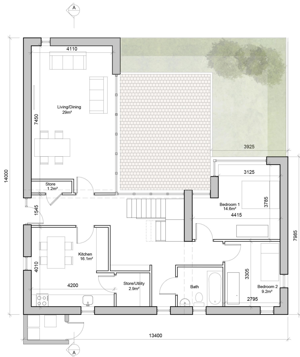
GROUND FLOOR PLAN AREA 106 SQM